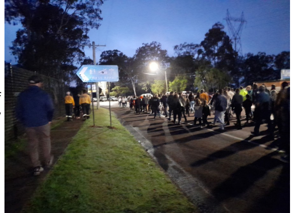
Dawn March along Tarean road

Anzac Day is always significant, but this year felt especially meaningful. The strong turnout, the shared moments of reflection, and the contributions from across the community all combined to create a very moving day and allowing greater participation from veterans, students, families, and community groups. And of course it wasn’t Anzac Day without the RSL free breakfast following the dawn Service and two-up at the conclusion of the 9:30am service.