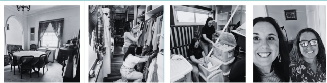
Home Sorting & Organising