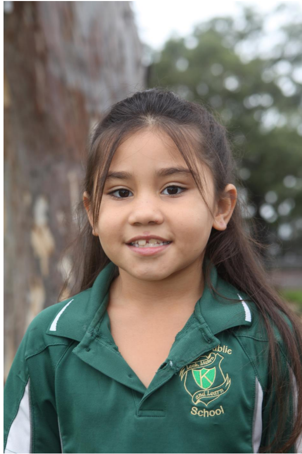
7 - Letti R: For her determination during ninjas