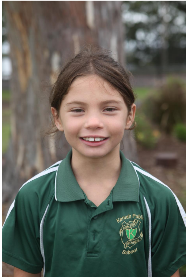
24 - Sailor F