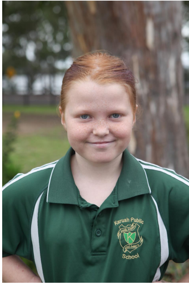
28 - Montana A