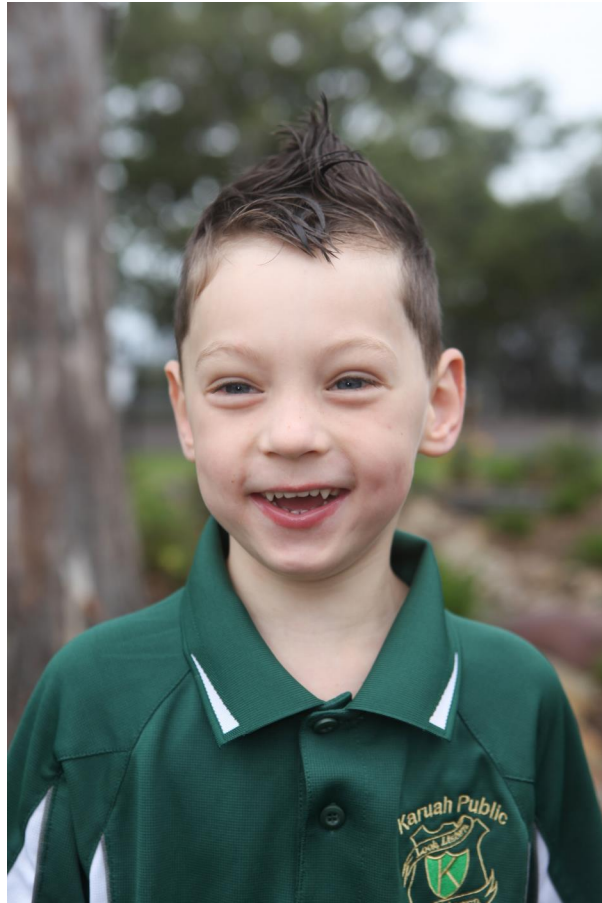
15 - Colt M: persistence and effort in library lessons