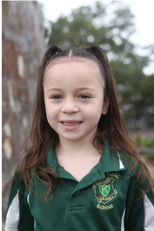
5 - Avarli R: for consistently participating in class discussions and offering insightful ideas