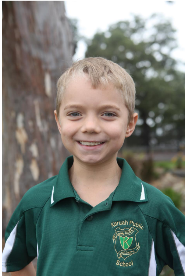
19 - Koa C