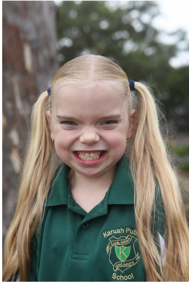
23 - Indi C