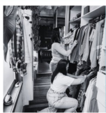
Deceased Estate homes