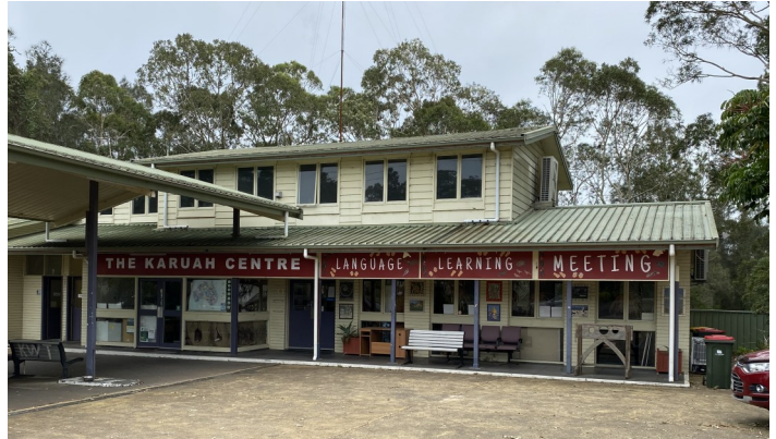
The Karuah Centre, 393 Tarean Road, Karuah

A friendship group is currently meeting at the Centre on Thursday’s 10am to 12pm.