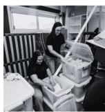
Moving help Packing/ Unpacking