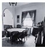
Home Sorting & Organising