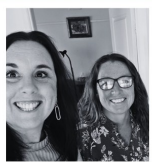
Advice & Advocacy