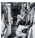
Deceased Estate homes