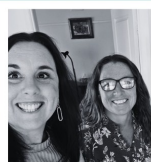
Advice & Advocacy