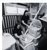
Moving help Packing/ Unpacking